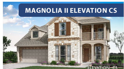
MAGNOLIA II ELEVATION CS