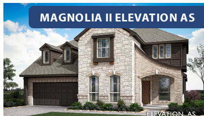
MAGNOLIA II ELEVATION AS