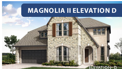
MAGNOLIA II ELEVATION D