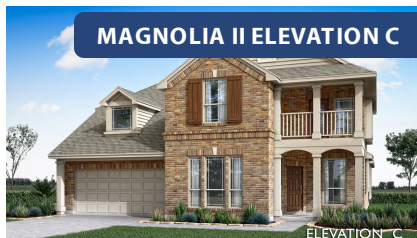
MAGNOLIA II ELEVATION C