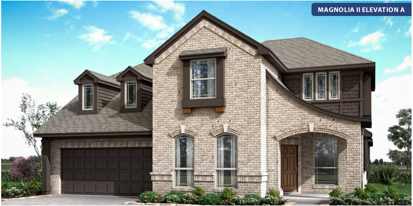
MAGNOLIA II ELEVATION A