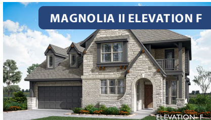
MAGNOLIA II ELEVATION F