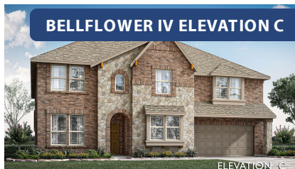
BELLFLOWER IV ELEVATION C