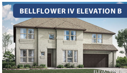
BELLFLOWER IV ELEVATION B