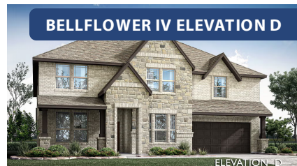
BELLFLOWER IV ELEVATION D